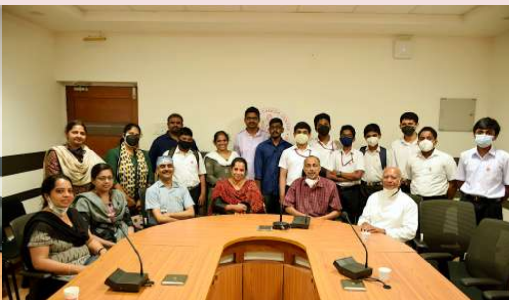
Loaf of Love distribution team at Regional Cancer Centre, Thiruvananthapuram