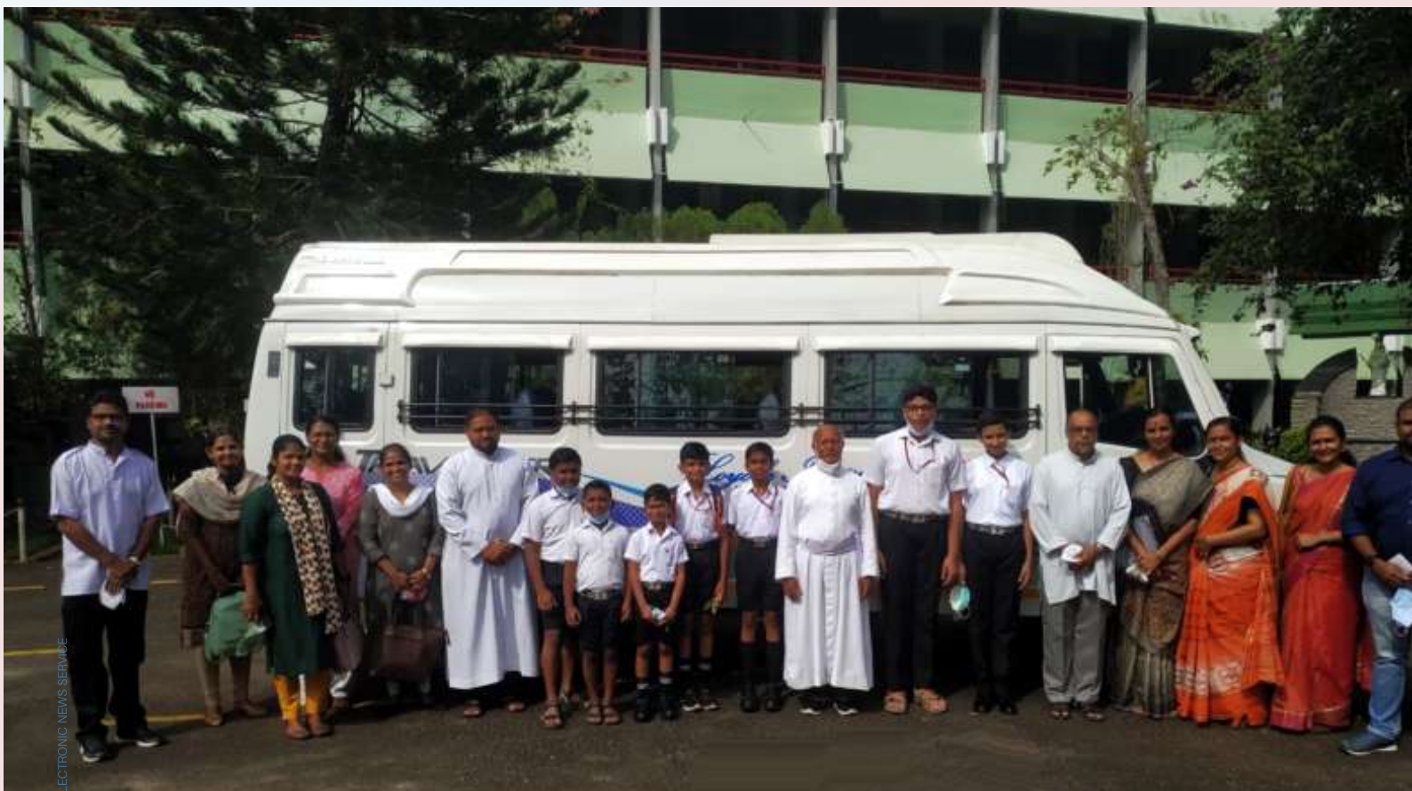
All set for the trip to Assisi Nikethan

The purpose of this visit was to hand over our Loaf of Love to them and see for